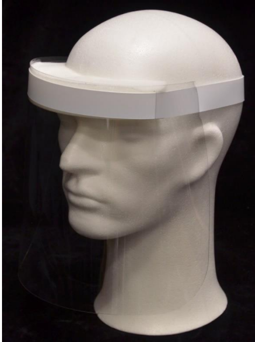
Photo of Face shield 23670110 and 23670111.