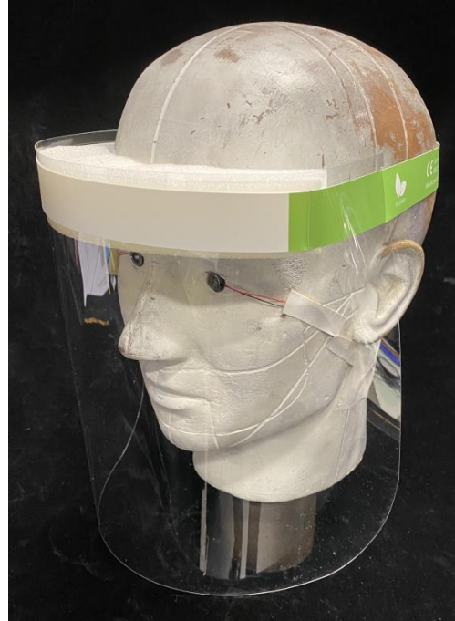
Photo of Face shield 23670200 and 23670201.