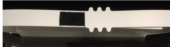
Model 23670111 and 23670201 with hook-and-loop fastener

Clear face shield models 23670110, 2367200 and 23670111, 23670201 (H&L) for protection against droplets and splashes of liquids. The face shield fulfils all mandatory requirements in EN 166:2001 Personal Eye-protection as well as the particular requirement § 7.2.4 - Protection against droplets and splashes of liquids.