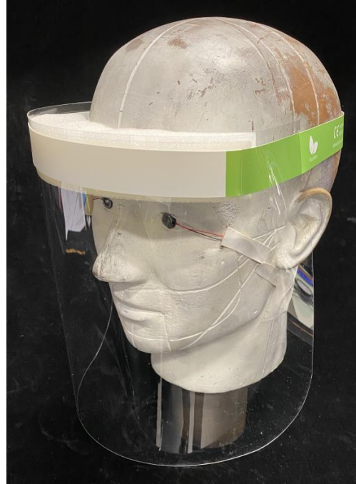
Photo of Face shield 23670200 and 23670201.