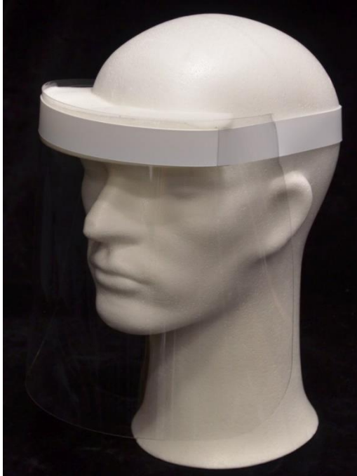
Photo of Face shield 23670110 and 23670111.